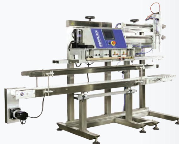
Vacuum and gas 7103/7503